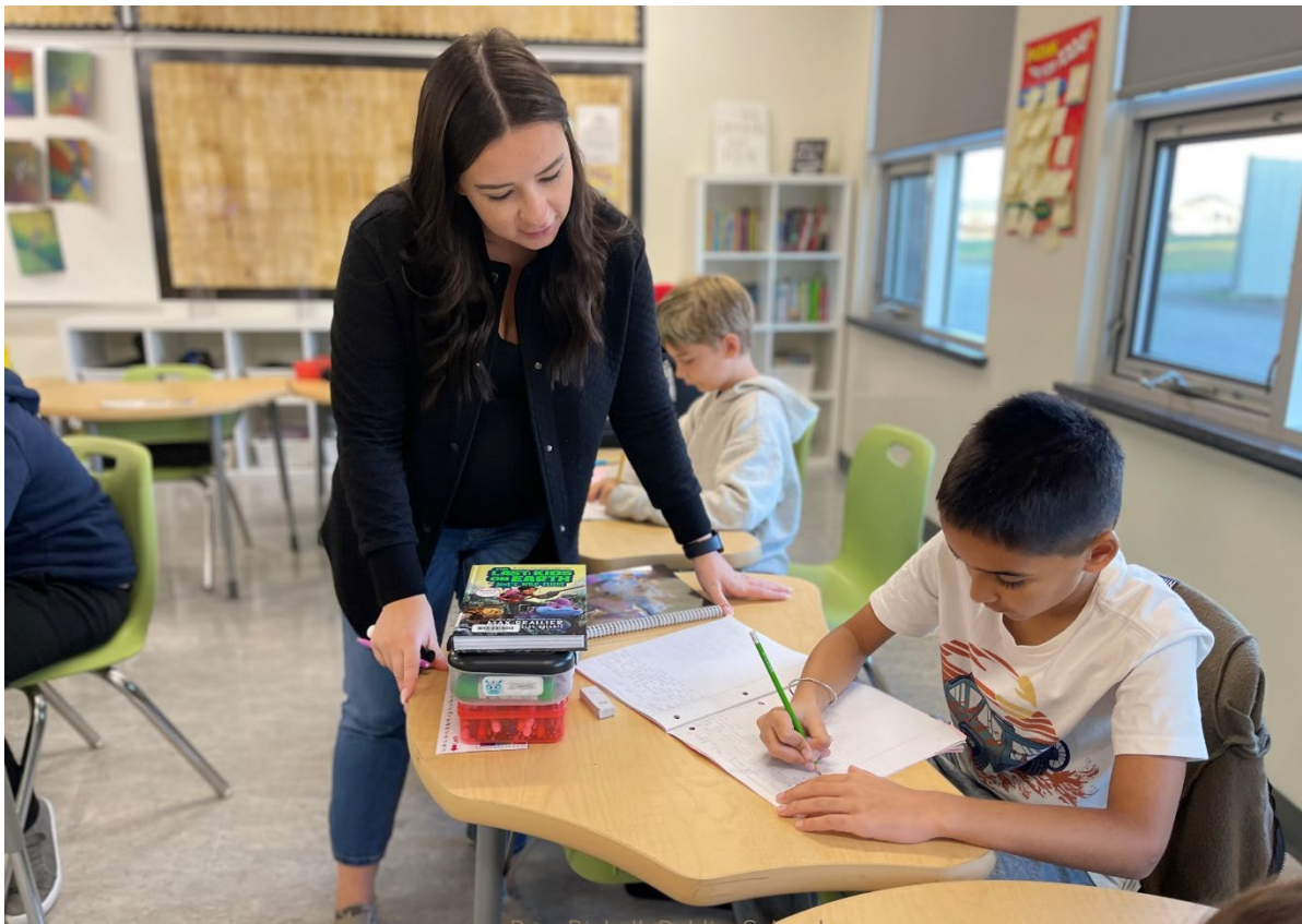
Roy Bickell Public School

Grande Prairie Public School Division Every Student Succeeds