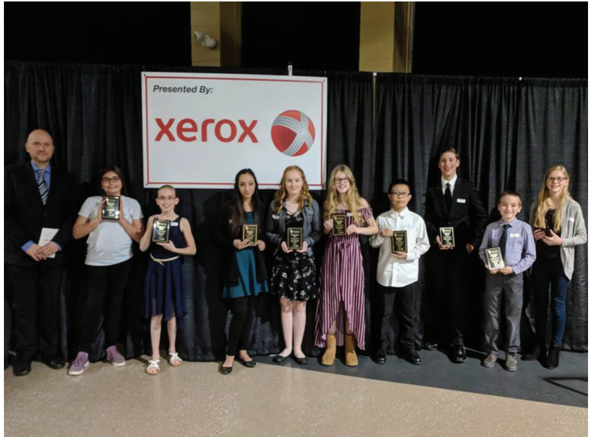
Students from Crystal Park School during the GPPSD Education Foundation's annual Striving for Excellence Award Dinner.

November 13, 2018 November 27, 2018 December 11, 2018 January 15, 2019 January 29, 2019 February 12, 2019 February 26, 2019 March 12, 2019 April 9, 2019 April 23, 2019 May 14, 2019 May 28, 2019 June 11, 2019