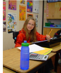
Environmental accommodations for the classroom.

OTs address skills and programming that students need for their job as a "Learner" in school: