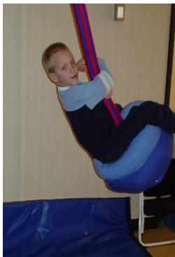
Sensory Processing Activities